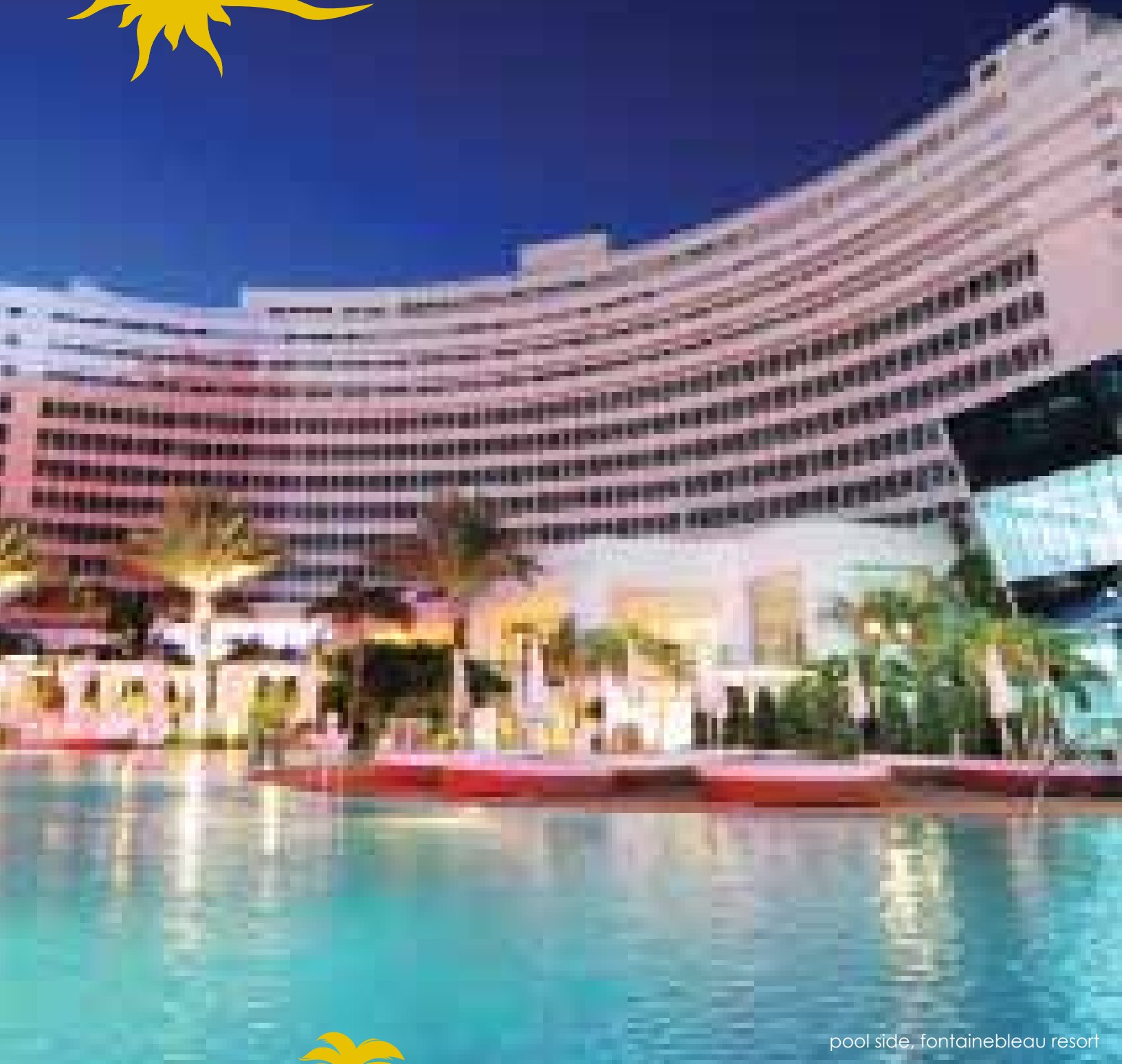
pool side, fontainebleau resort